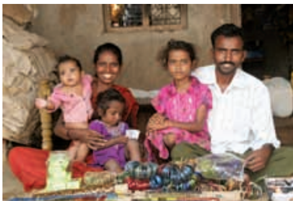
Income sources are diversifying